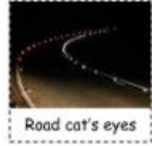
Road cat's eyes