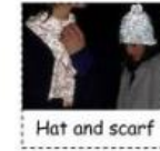
Hat and scarf