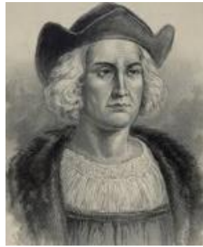
Christopher Columbus was a famous Italian explorer who was born in 1451.