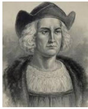
Christopher Columbus was a famous Italian explorer who was born in 1451.