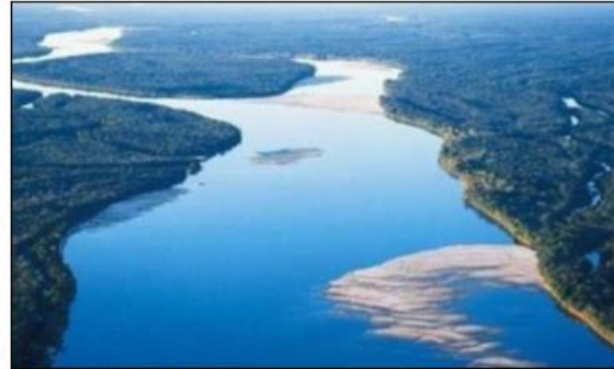
The River Nile

The River Nile is the longest river in the world which flows through the Mediterranean Sea. People settled near the Nile as it was a useful source of water (used for drinking, washing, watering crops). Boats on the River Nile were the main source of transport. They were also useful as it enabled trading.