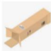
A long box.