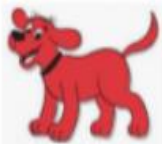
A red dog.