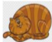
A fat cat.