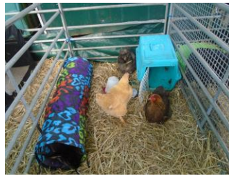
A farm visit to our school