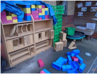
Outdoor building area

We divide the year into 6 half termly topics. Our staff and children come from a wide background. This is reflected in our curriculum. We take every opportunity to explore cultures and traditions, including sharing food, dressing up and looking at artefacts. We go on visits and encourage visitors to school.